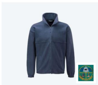
Fleece Jacket Navy (Banner)