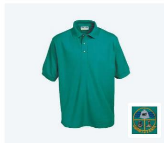
Polo Jade (TTT)