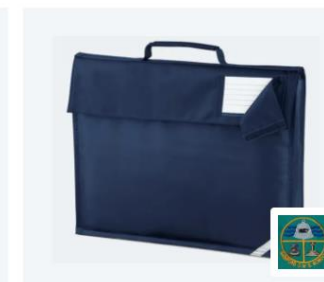
Book Bag Navy (QD51)