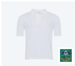
Polo White (TTT)