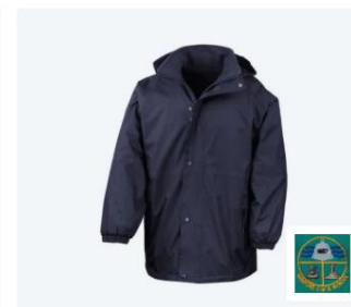
Reversible Jacket Waterproof Navy (R160)