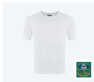
P.E. T-Shirt White (Banner) from £6.25