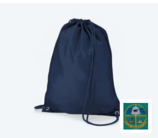
P.E. Bag Navy (QD17)