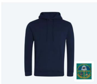
Hoodie Navy (TTT) from £12.25