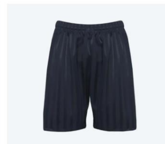
Shorts Shadow Stripe Navy - No Logo (Banner)