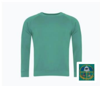
Sweatshirt Jade (TTT)

Parents are responsible for ensuring their child brings their PE kit to school when needed.