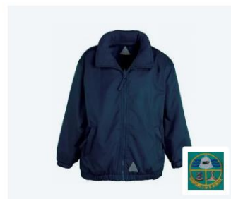
Mistral Jacket Showerproof Navy (Banner)