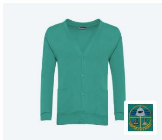
Cardigan Jade (TTT)